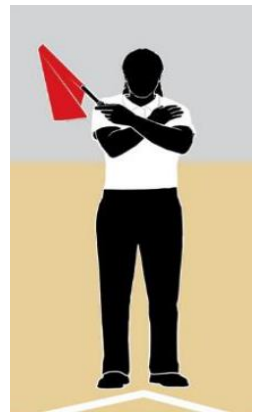
View of play blocked